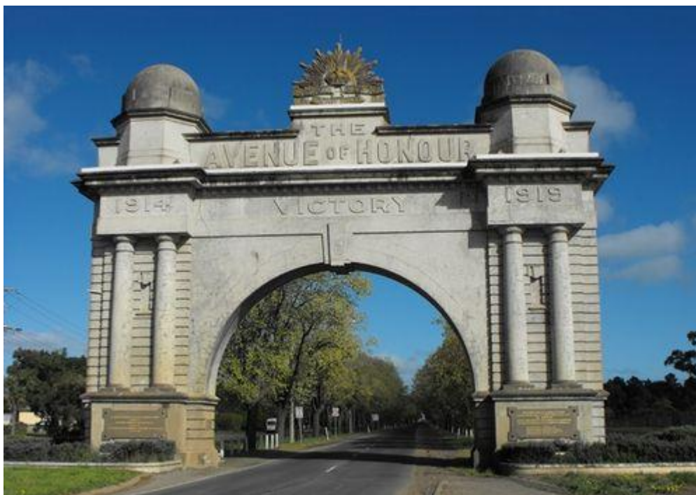
The Arch of Victory was built as an entrance to the Avenue of Honour

J. J. Cahill is also remembered on the Ballarat Avenue of Honour (1917-1919) where almost 4,000 trees were planted to represent the number of men and women from the Ballarat district who served in World War 1. The trees were planted at intervals of 12 metres along 22 kms of the Ballarat-Burrenbeet Road. The Ballarat Avenue of Honour is famous for being the first avenue of its kind in Australia. Tree number 842.