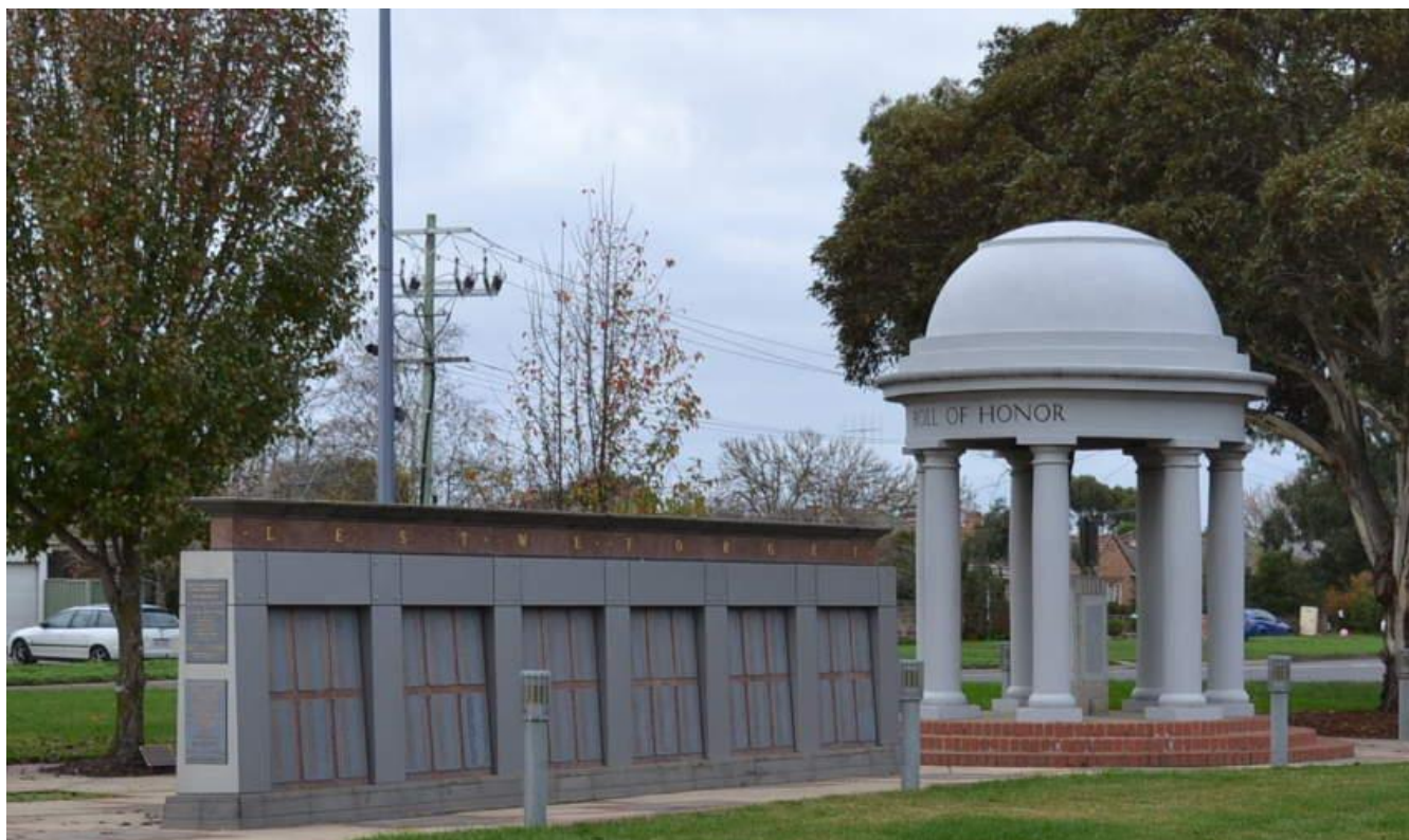
Ballarat Memorial Wall & Rotunda