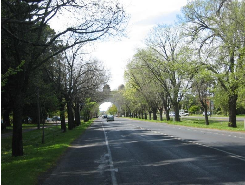
Ballarat Avenue of Honour